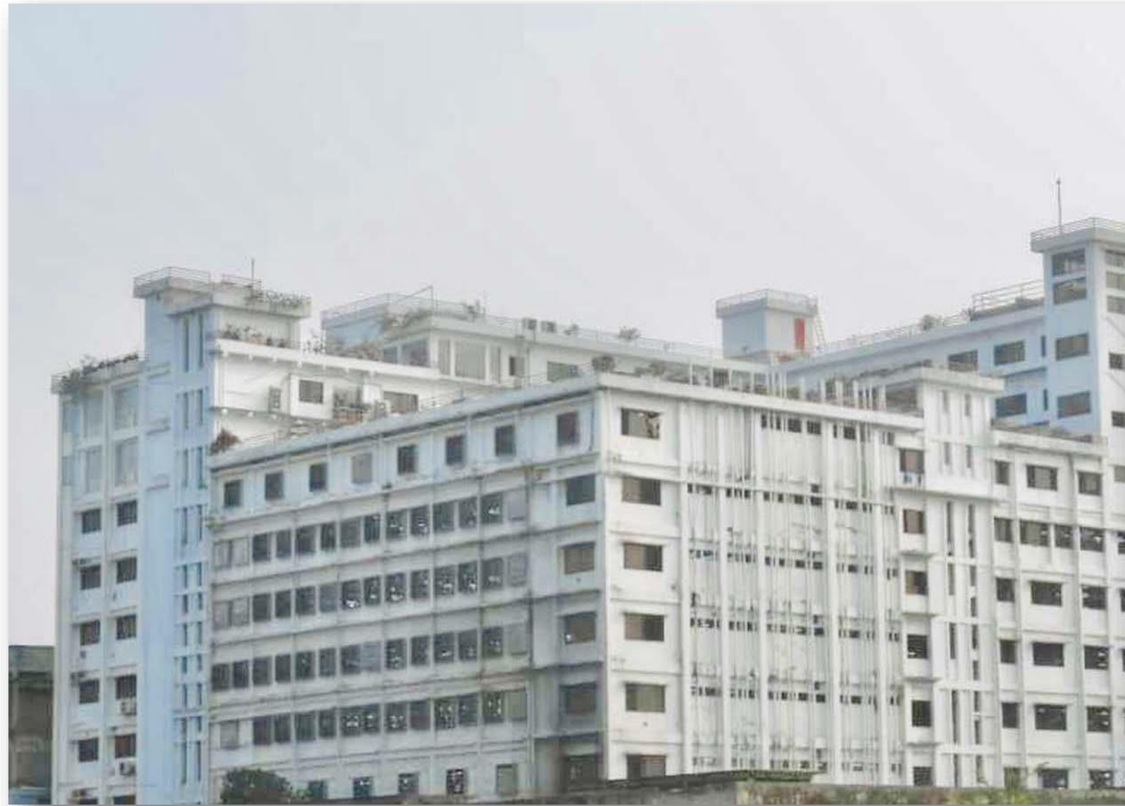
Bottoms Complex - Dhaka, BD