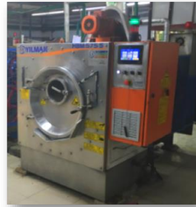
30 LBS Tumbler