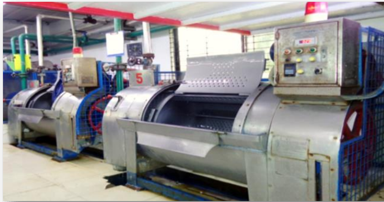
100 LBS Tumbler