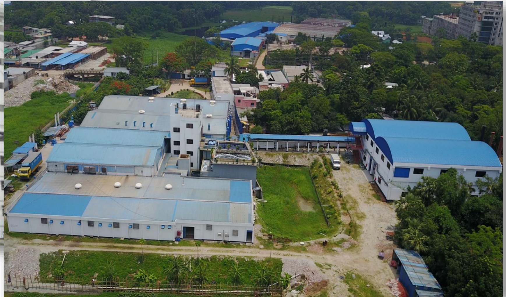
Denim Wash - Dhaka, BD