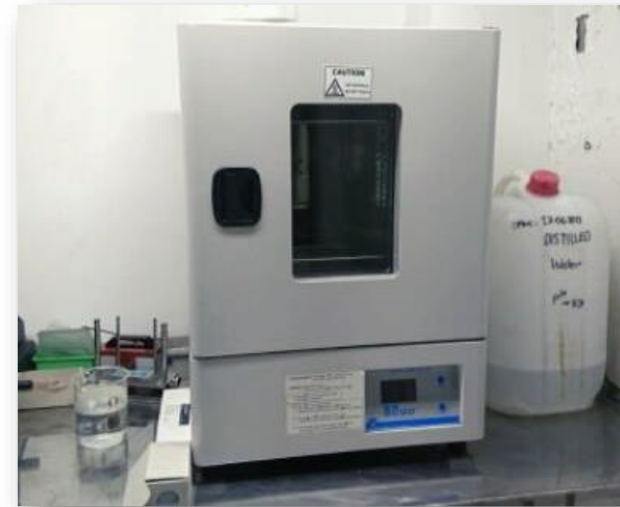
Hot Air Oven